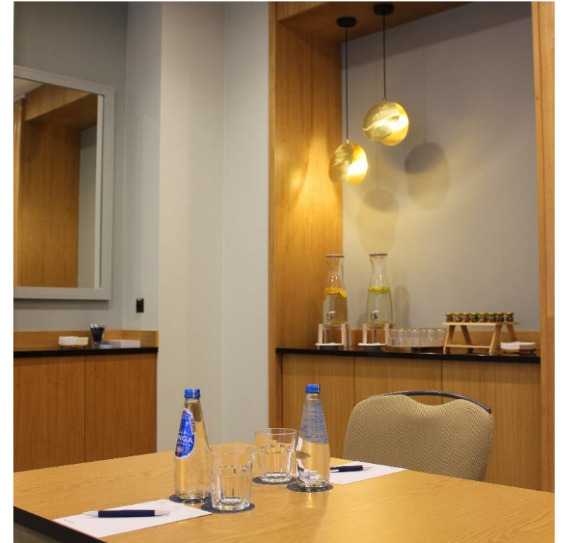
Attention to details