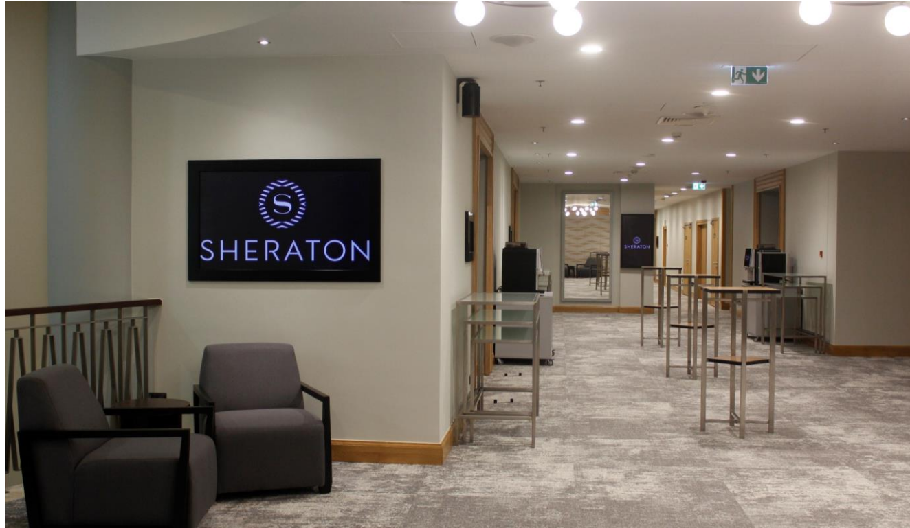
Refurbished rooms and foyer with advanced digital signage